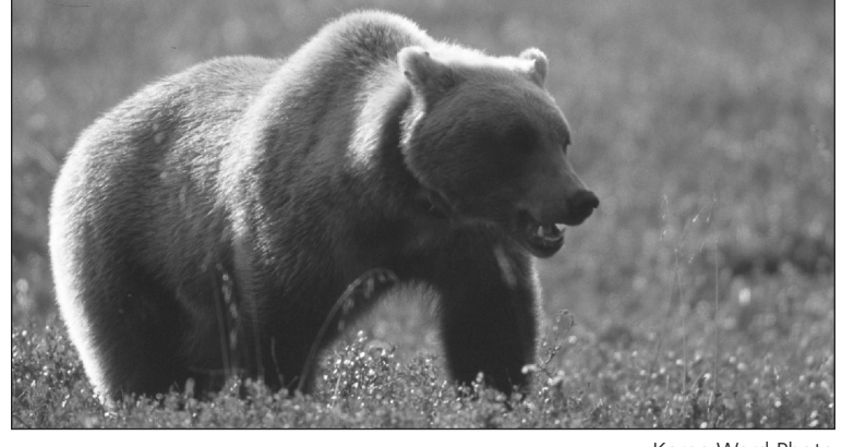
Karen Ward Photo