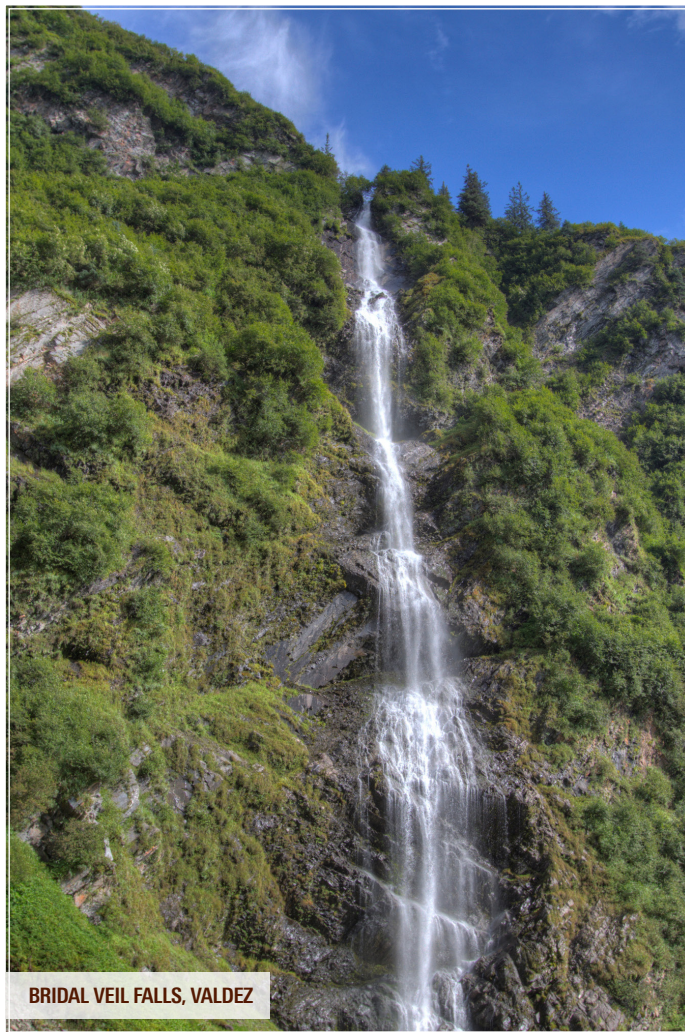
BRIDAL VEIL FALLS, VALDEZ

Drive 5 hours back to Anchorage. Return RV.