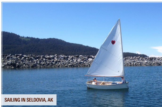
SAILING IN SELDOVIA, AK

Angoon, Bellingham, Gustavus, Haines, Hoonah, Juneau, Kake, Ketchikan, Metlakatla, Pelican, Petersburg, Prince Rupert, Sitka, Skagway, Tenakee, Wrangell, Yakutat