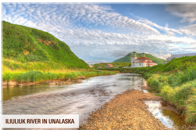
ILIULIUK RIVER IN UNALASKA

Chenega Bay, Cordova, Homer, Seldovia, Tatitlek, Valdez, Whittier